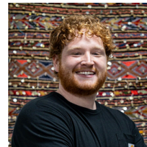
Henry Jenks Language Center