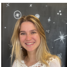
Cierra Schreck Center for Learning Excellence