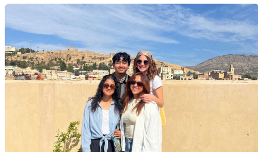
Life Outside of the Office: Trip to Fes