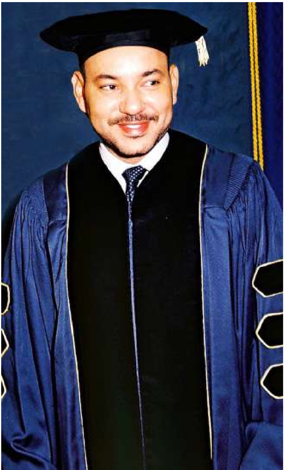
His Majesty King Mohammed VI at The George Washington University where he received an honorary doctorate on June 6, 2000.