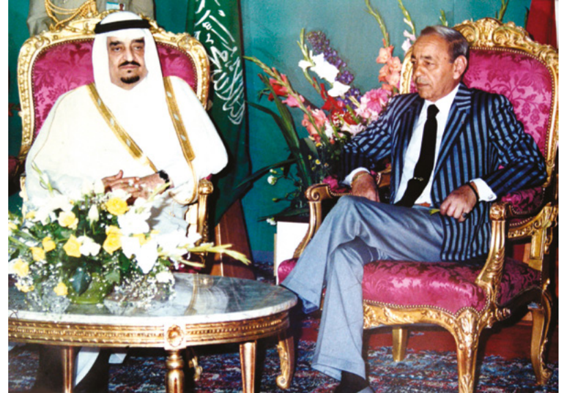
The University's two founding brothers (Al Akhawayn) The late King Hassan II of Morocco and the late King Fahd Ibn Abdulaziz of Saudi Arabia