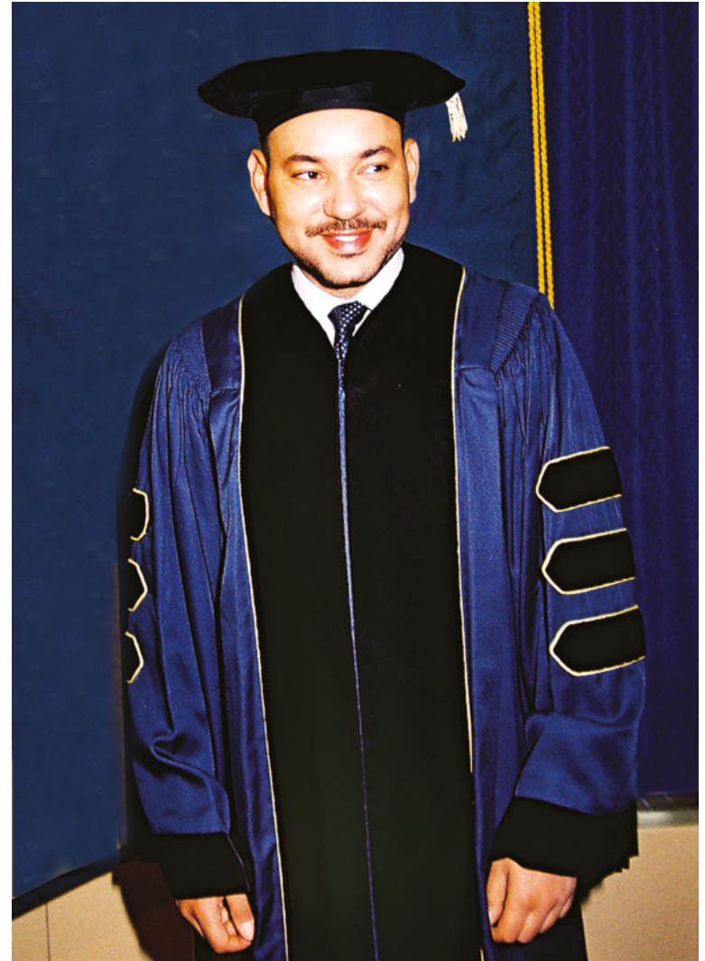
His Majesty King Mohammed VI at The George Washington University where he received an honorary doctorate on June 6, 2000