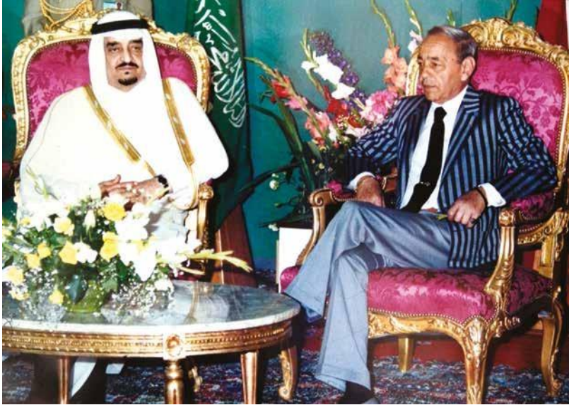
The University's two founding brothers (Al Akhawayn) The late King Hassan II of Morocco and the late King Fahd Ibn Abdulaziz of Saudi Arabia