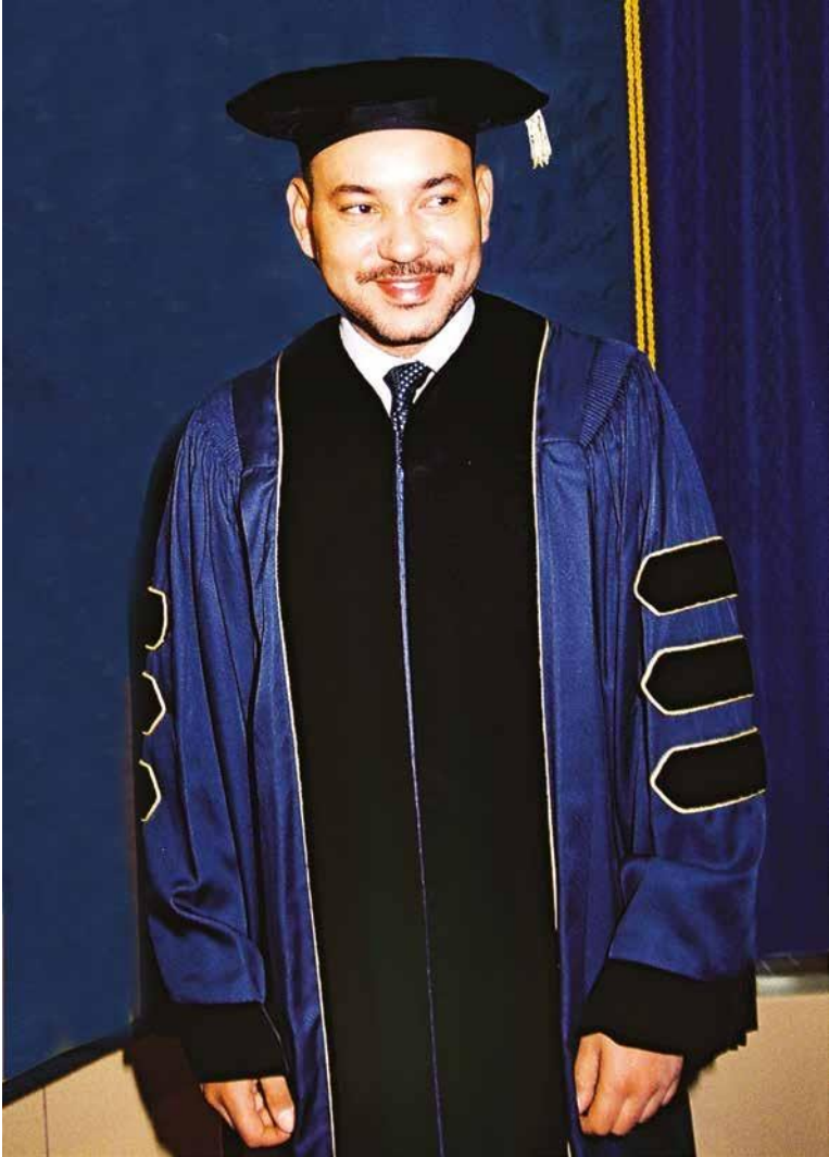
His Majesty King Mohammed VI at The George Washington University where he received an honorary doctorate on June 6, 2000